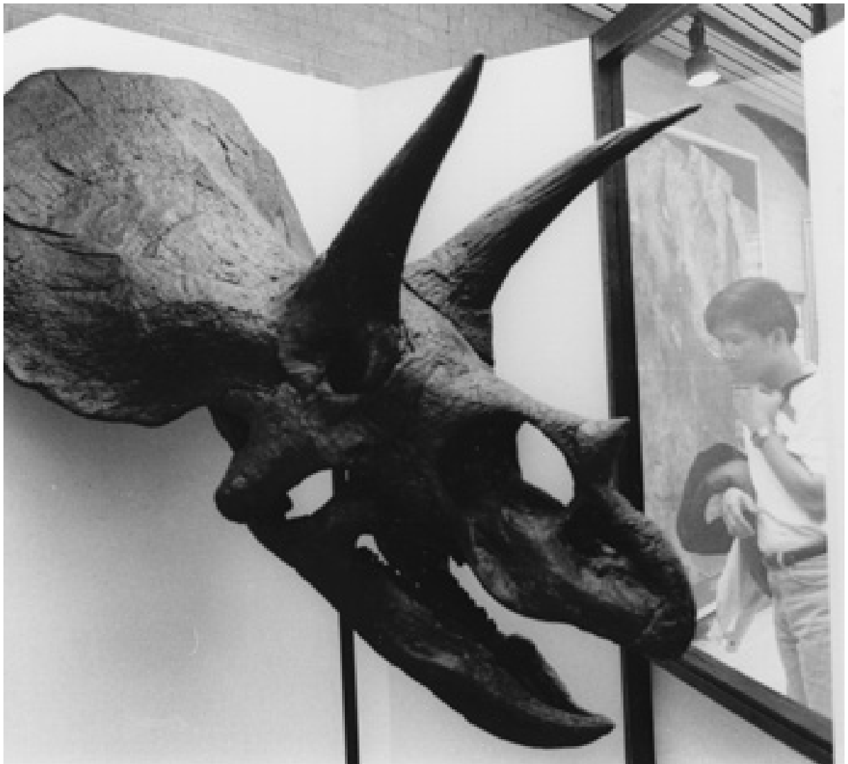
Museum of Geology