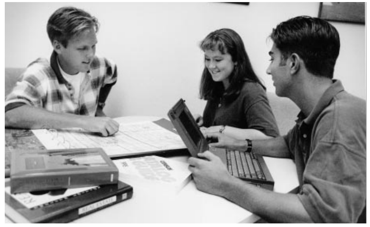
Active team participation and hands-on projects help College of Business students understand the value of collective thinking.

Due to resource limitations, admission to all of the school's programs is very competitive. Approximately one third of all applicants who apply to the professional programs in Accountancy and Computer Information Systems may be admitted. Applicants are reviewed using a portfolio approach. Among the factors considered are: cumulative GPA, skill course GPA, transfer GPA and institution (if applicable), work experience, demonstrated community involvement and leadership skills, and responses to questions located in the professional program application. For