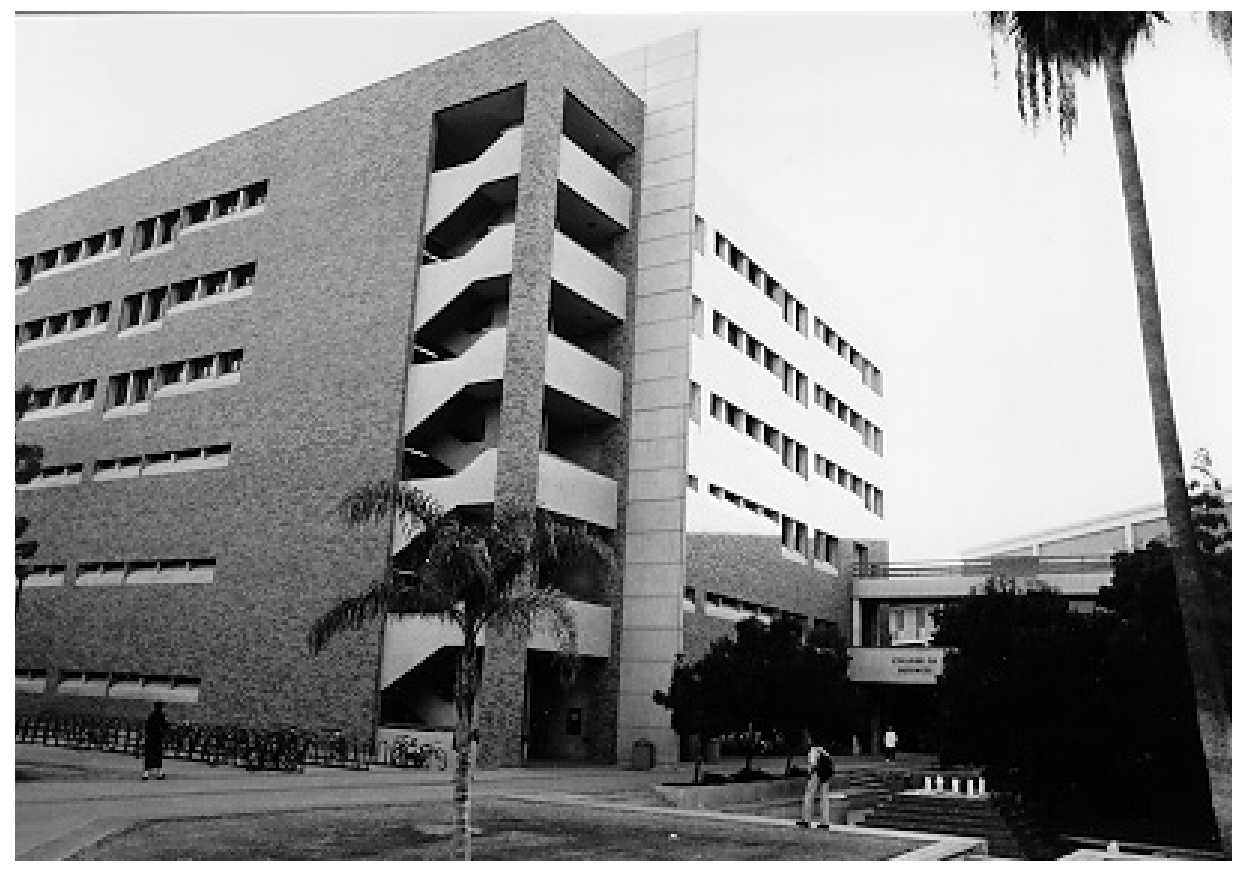
Business Administration C-Wing