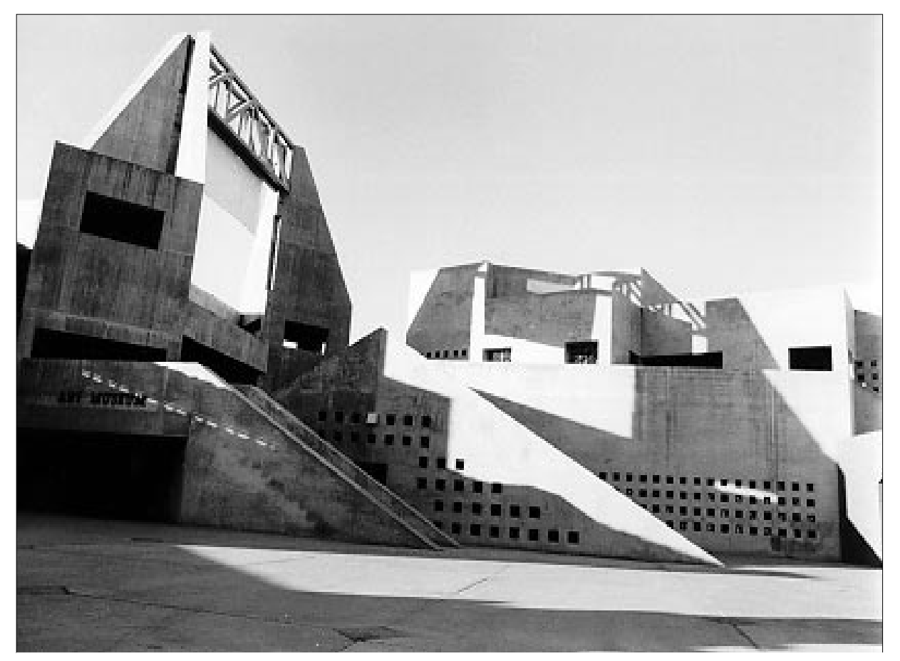
Nelson Fine Arts Center