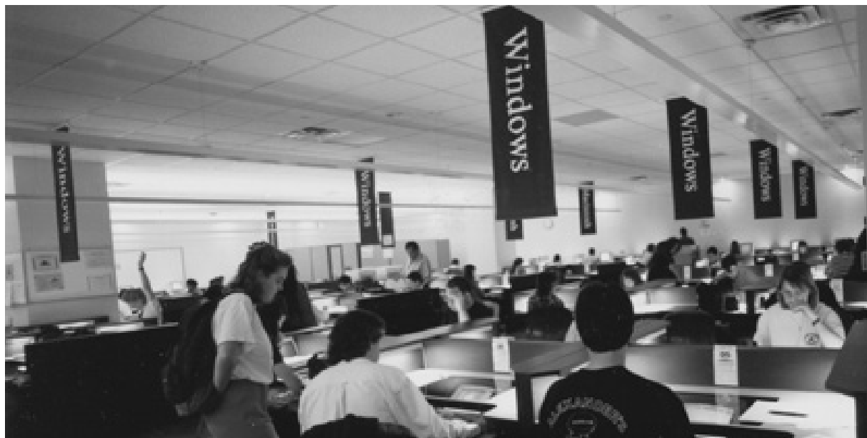
Technopolis Computer Lab