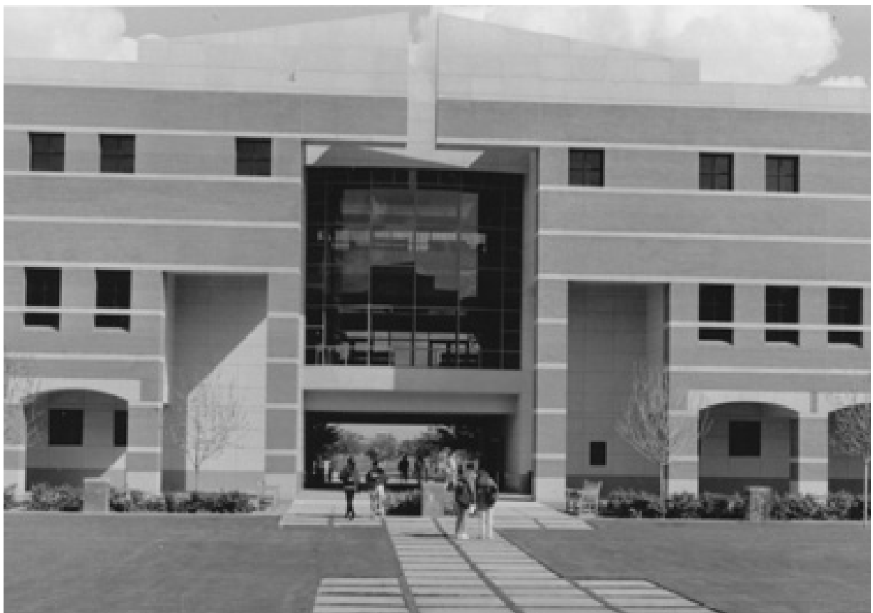
ASU West Classroom Laboratory/Computer Building