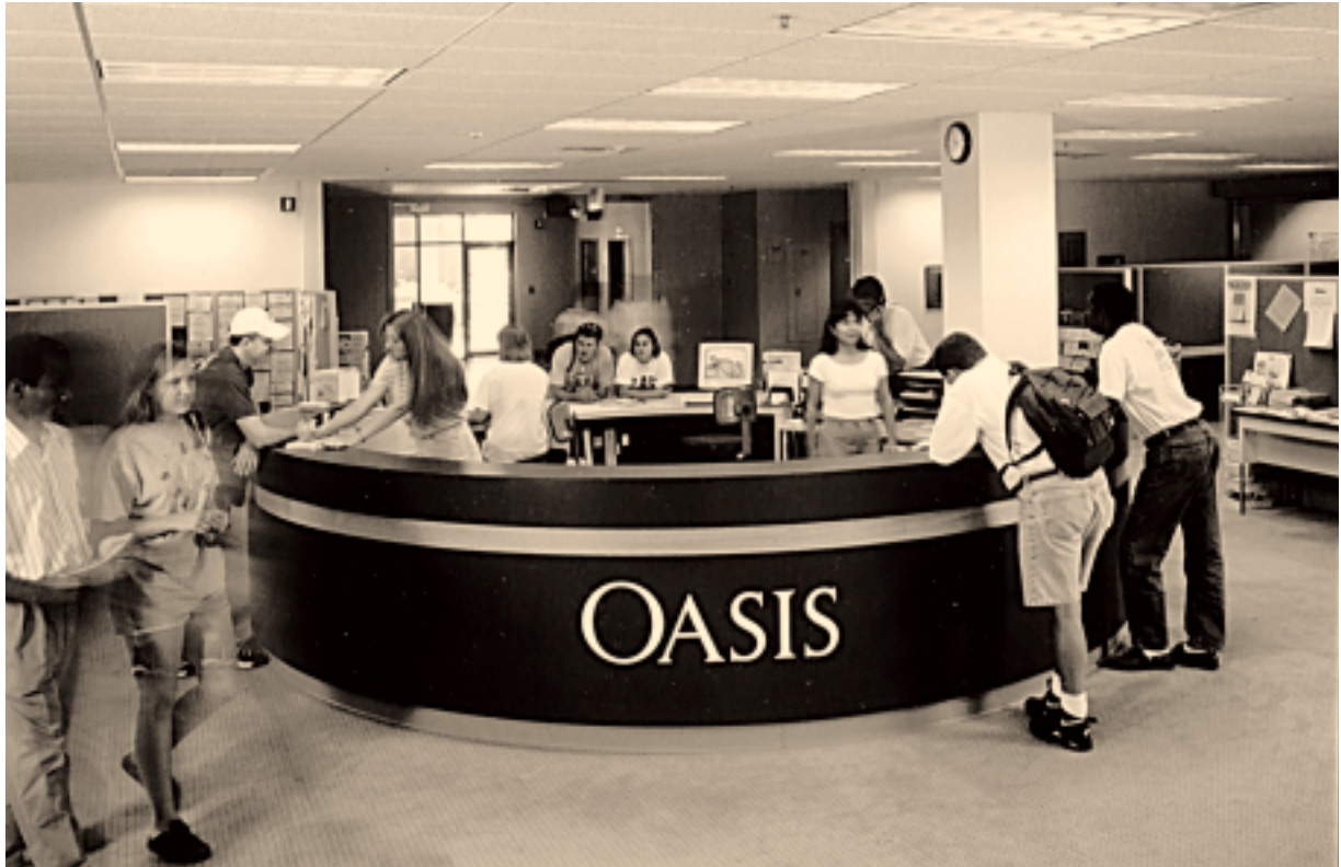
The Oasis at ASU East