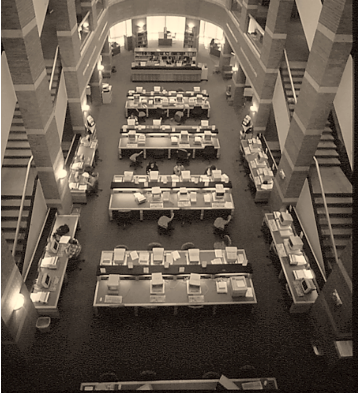
Fletcher Library at ASU West is a state-of-the-art information access center designed to take advantage of the latest technology.