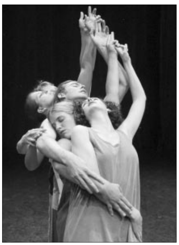
The Department of Dance offers the public several performances each year.

M.F.A. Project. Each candidate submits a prospectus to his or her supervisory committee outlining the nature of the M.F.A. project. This project may be choreography and/or performance, and may be designed to incorporate technology or other approved research components. Supporting documentation of the project may be written and bound, realized with CD-ROM, or completed through other means, which meet format approval from both the student's supervisory committee and the Graduate College.