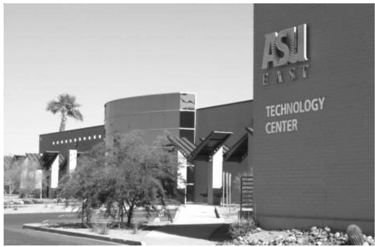
The College of Technology and Applied Sciences helps students develop knowledge and skill in technological fields that qualify them for career positions and leadership responsibility in industry, government, and commercial enterprise.