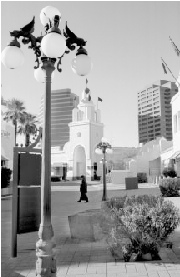
ASU Downtown Center