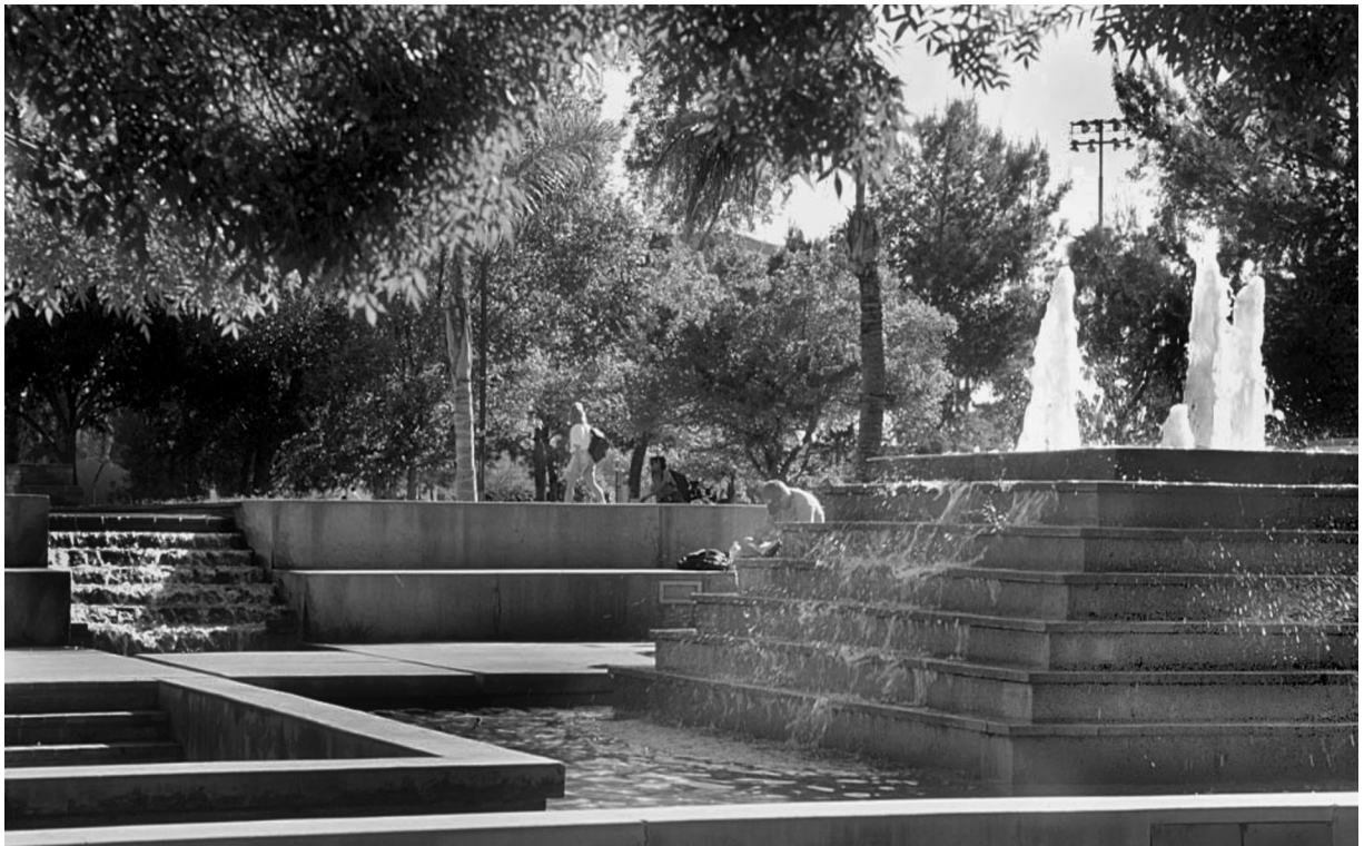
ASU students enjoy the beauty and solitude of the elaborate fountain and waterway system near the College of Business.

Council of Emeritus Advisers. The Council of Emeritus Advisers founded by the College of Business and Dean's Council of 100, is a select group of retired executives who advise the dean and invite nationally known experts to Arizona as visiting scholars, lecturers, and speakers.