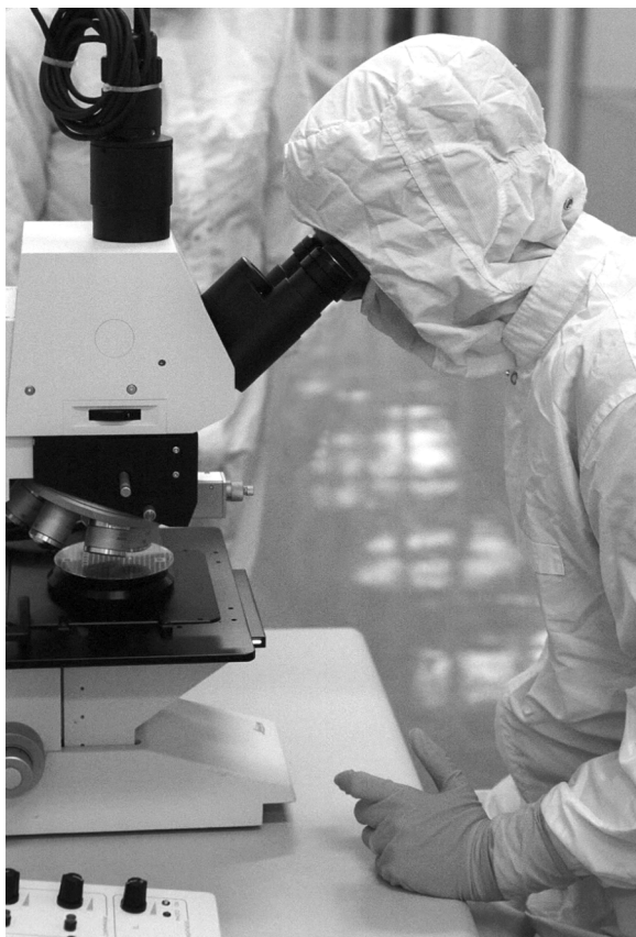
The wafer manufacturing laboratory at ASU East