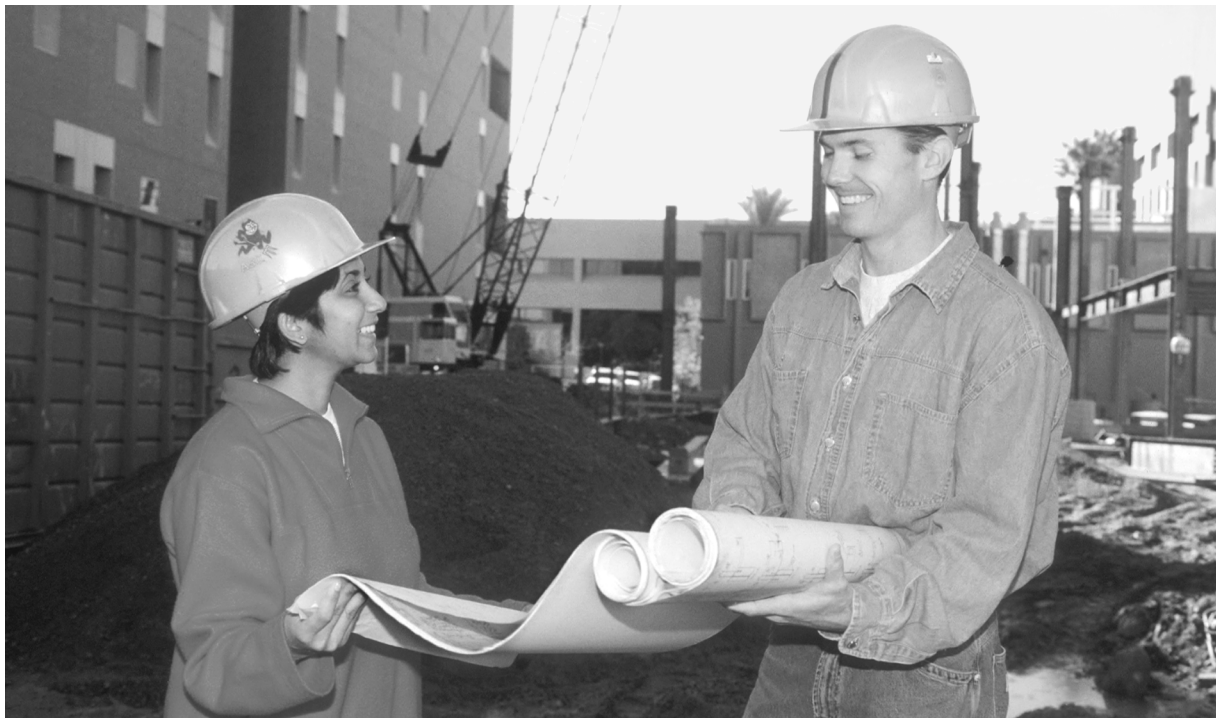
Graduate students from the Del E. Webb School of Construction work together at a construction site on campus.

The College of Engineering and Applied Sciences serves the high technology community through the Interactive Instructional Television Program. The system allows employees of participating companies to attend graduate-level courses, special interest seminars, and video teleconferences without leaving their place of employment. In cooperation with the National Technological University, the college also provides instruction via satellite.