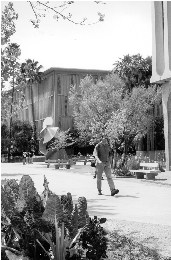
Farmer Education Building in the background of Forest Mall