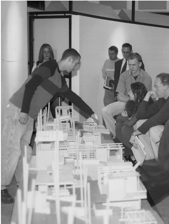
Graduate students critique a student's model at the College of Architecture and Environmental Design.