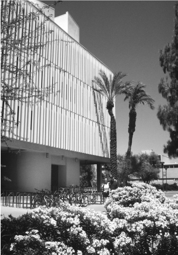
The Stauffer Communication Arts Building