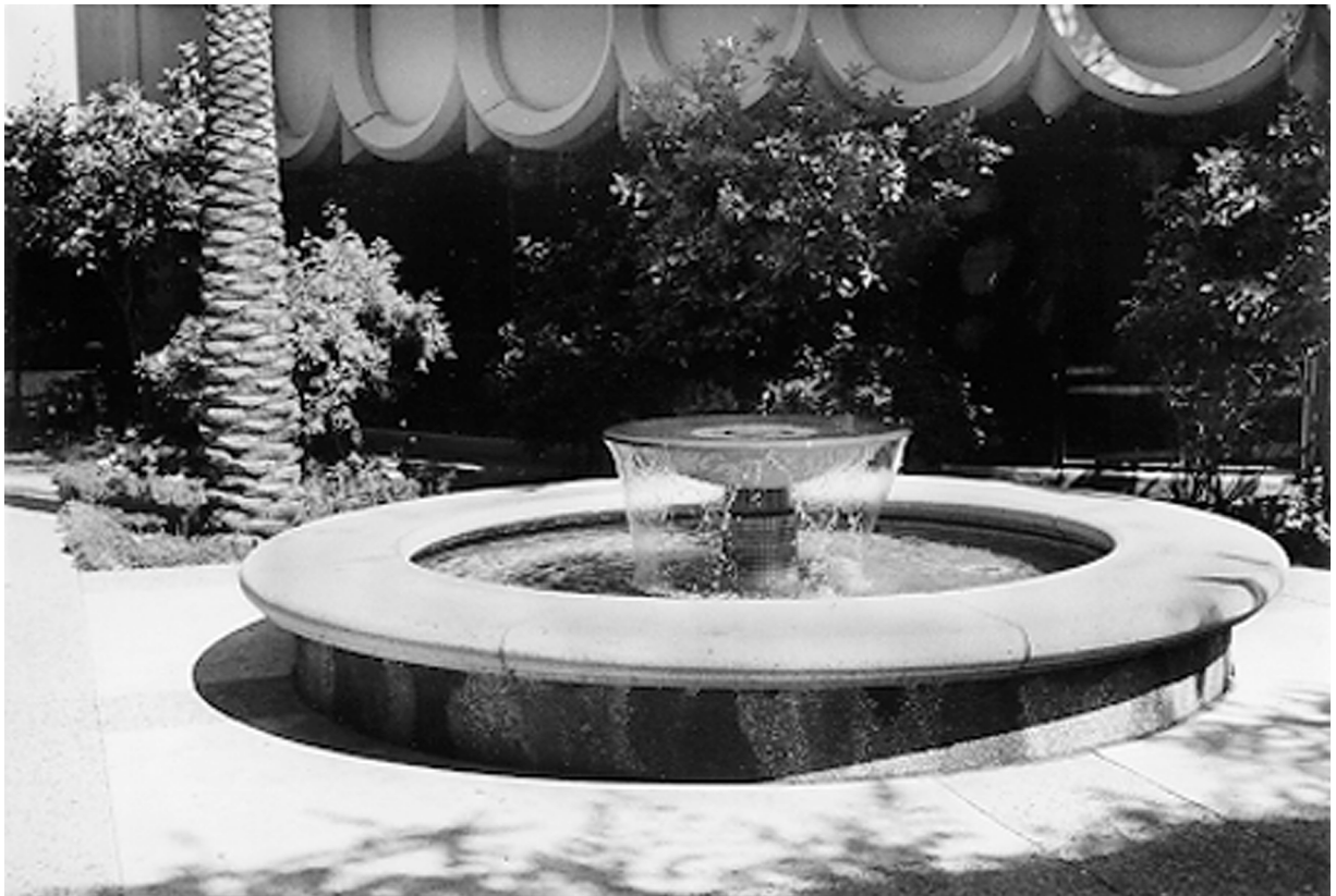
One of the many fountains on campus

One of the unique features of an interdisciplinary program is that it uses faculty research and teaching interests from a large number of academic units. Students may tailor a course of study to fit individual needs and goals.