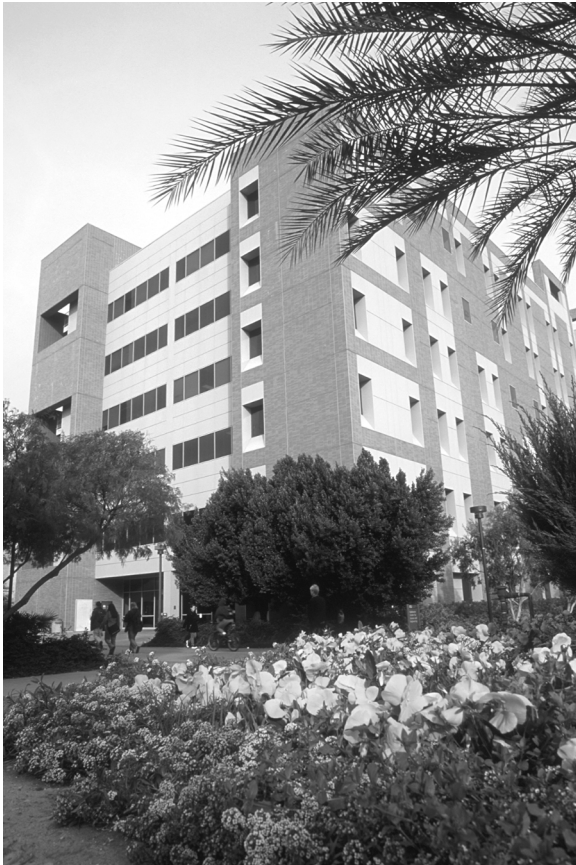
The Goldwater Center for Engineering Research