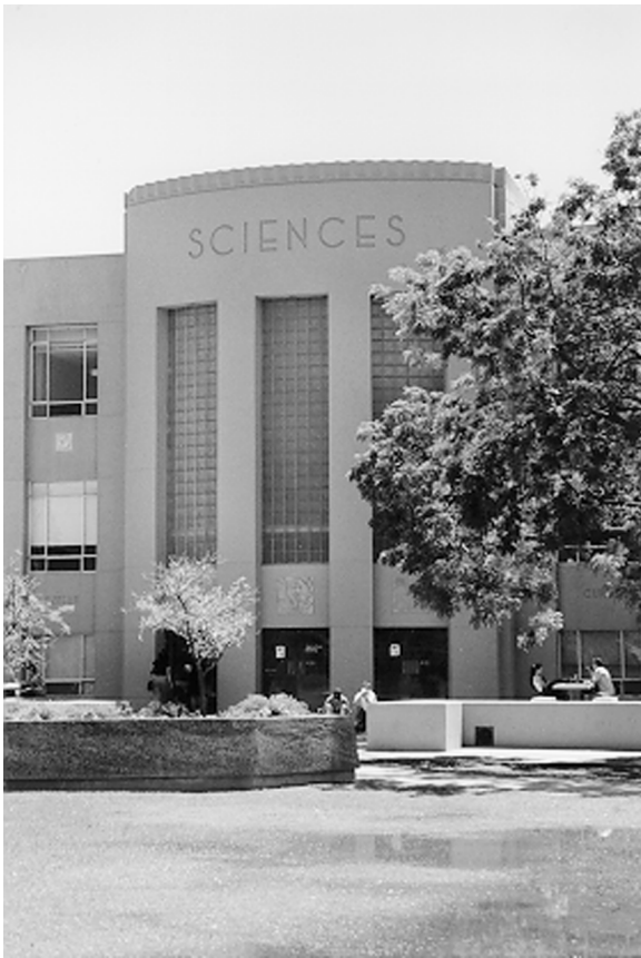
The Agriculture Building on the ASU Main campus