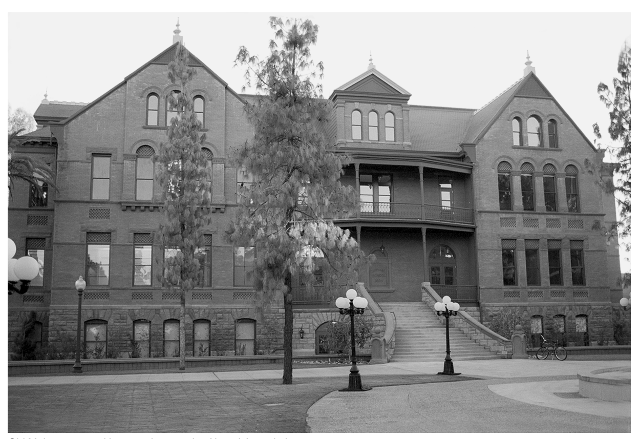
Old Main, renovated in 2000, houses the Alumni Association.

For more information on the Ph.D. degree, see "Doctor of Philosophy," page 103.