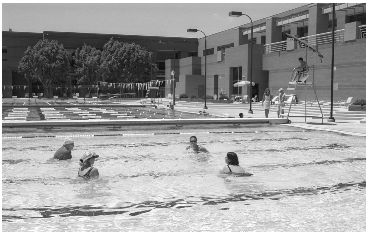
The Student Recreation Complex, featuring a 70-meter outdoor pool, is one of the finest collegiate workout facilities in the U.S.

Omnibus Graduate Courses. See page 50 for omnibus graduate courses that may be offered.