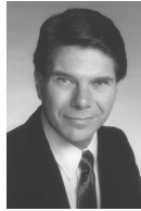
ROBERT B. CIALDINI Psychology