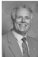
JEFFREY COOK Architecture