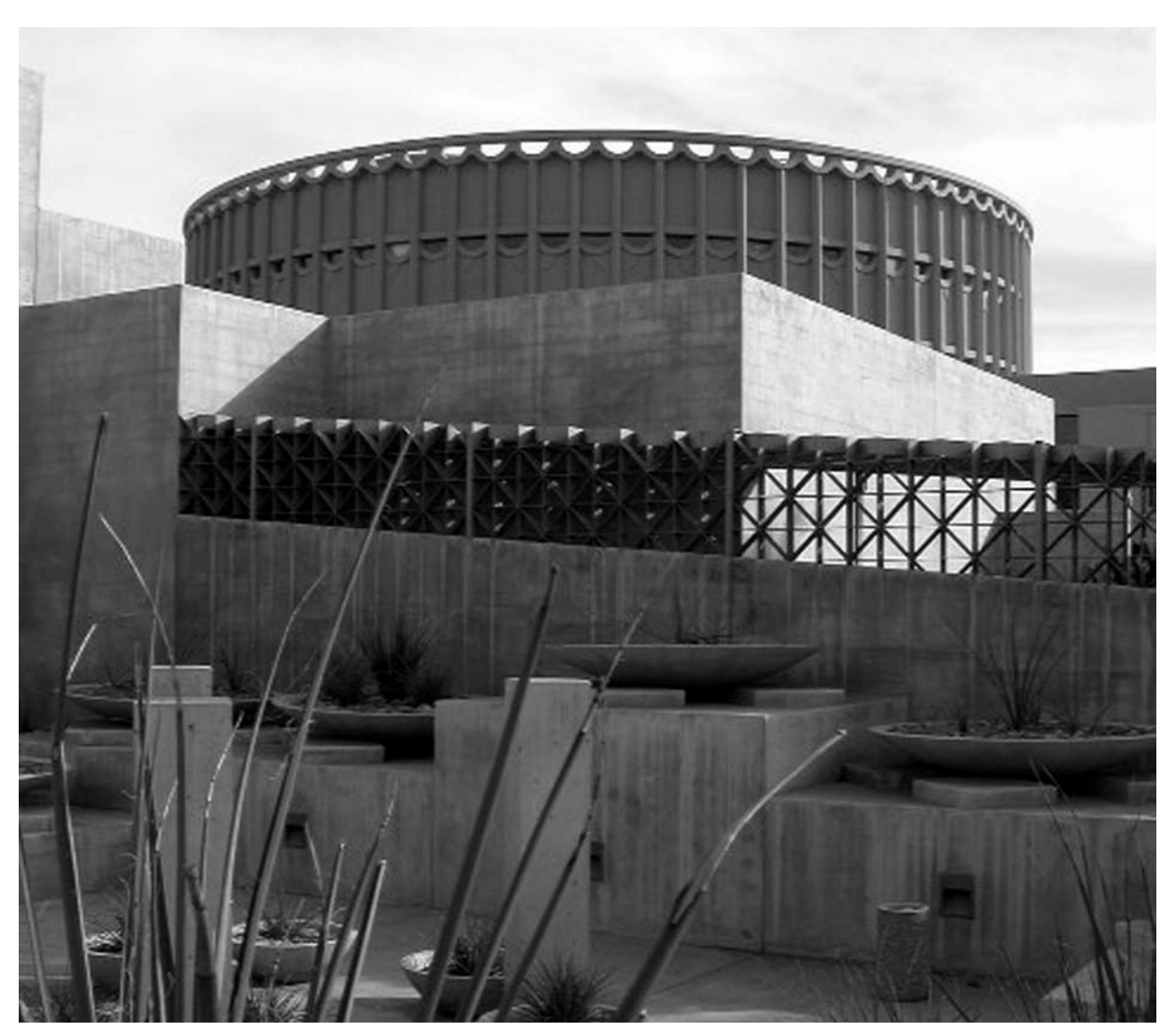
The ASU Art Museum's entry with the music building in the background

For some special international programs, students register and receive credit for fewer semester hours.