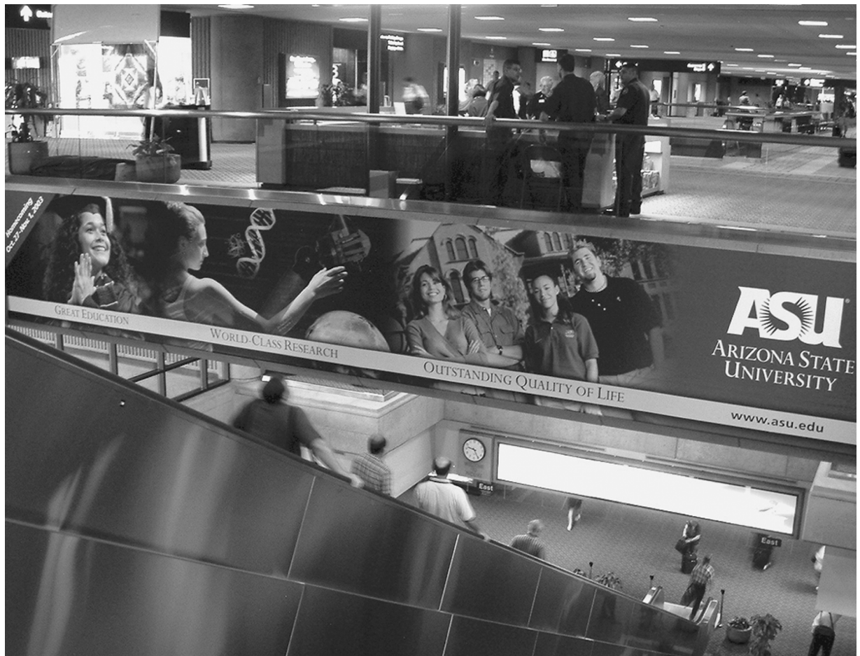
This wall wrap—highlighting ASU academics, research, and quality of life—greet the estimated 24 million people passing through Phoenix Sky Harbor Airport’s Terminal Four annually.

Joint Admission Continuous Enrollment. Courses with the JAC prefix are used to track students admitted to ASU who are concurrently or solely enrolled in courses offered by a community college.