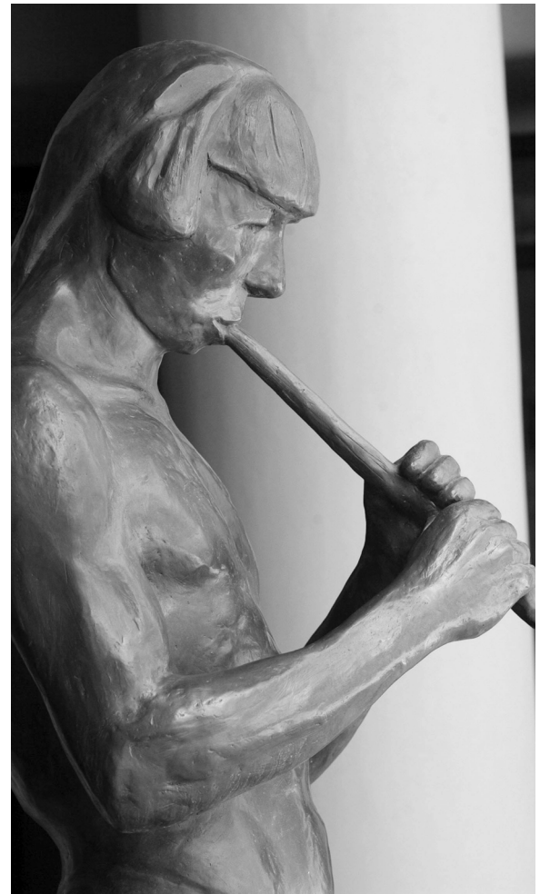
Hopi Flute Player is one of many sculptures on ASU Main campus.

ASU West offers a Master of Arts degree in Criminal Justice. For information, see the ASU West Catalog , call 602/543-4567, or access www.west.asu.edu on the Web.