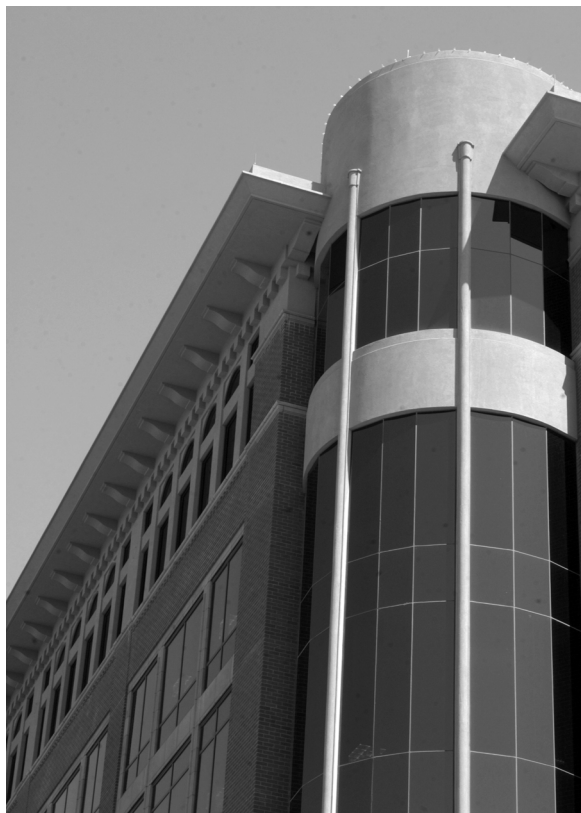
The Brickyard, in downtown Tempe, houses the Ira A. Fulton School of Engineering dean's office and the Department of Computer Science and Engineering.

The program is housed in the Hugh Downs School of Human Communication and is designed to prepare scholars