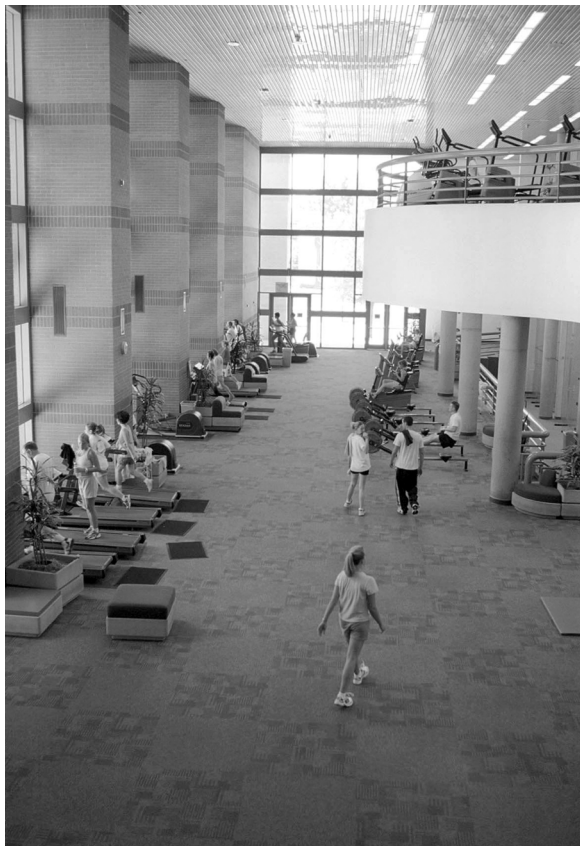
The Student Recreation Complex offers students many workout possibilities.

Reviews funding structures utilized by nonprofit organizations; financial tools used by managers; fund raising practices and tools. Lecture, case study.