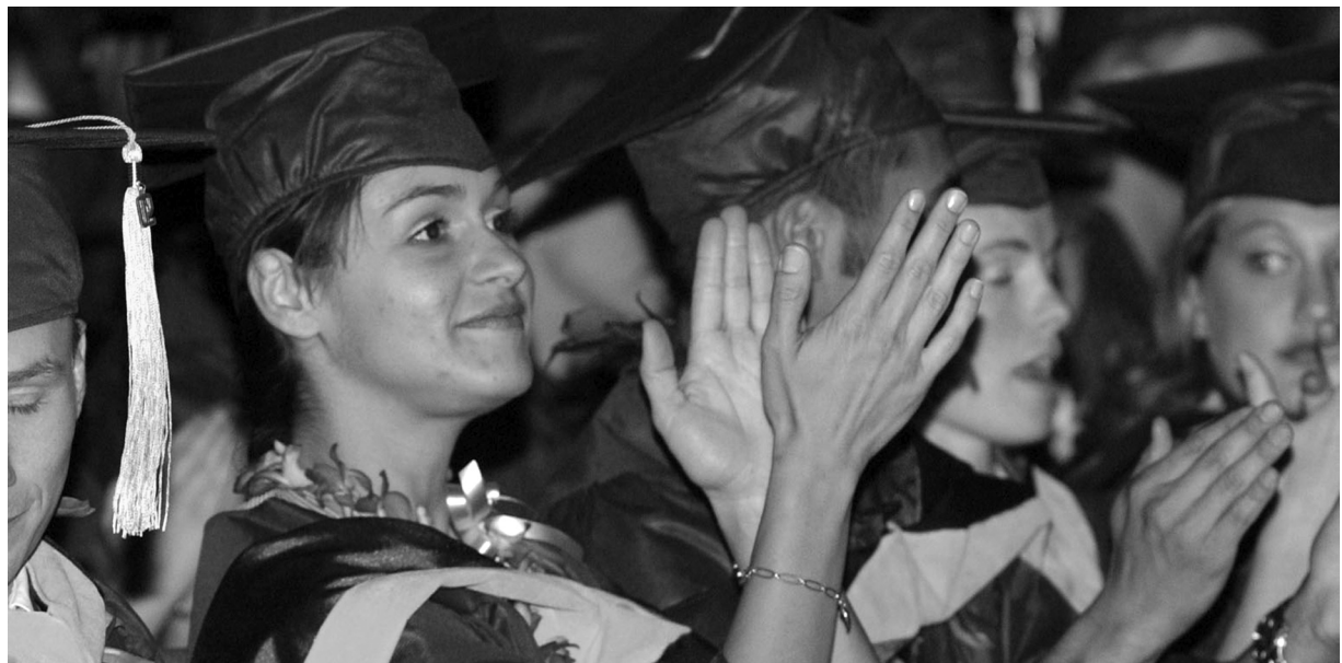
ASU East graduates celebrate their accomplishments during spring commencement.

Omnibus Courses. For an explanation of courses offered but not specifically listed in this catalog, see "Omnibus Courses," page 50.