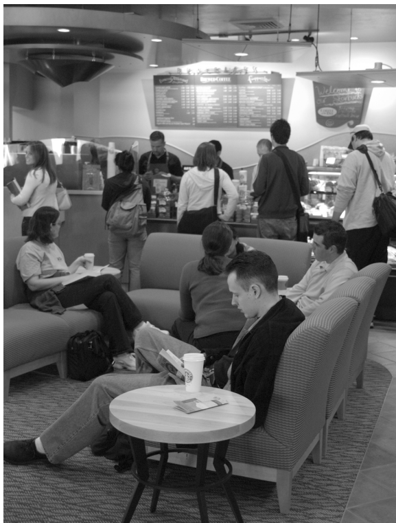
The W. P. Carey School of Business features a snack and beverage lounge.

Omnibus Courses. For an explanation of courses offered but not specifically listed in this catalog, see "Omnibus Courses," page 50.