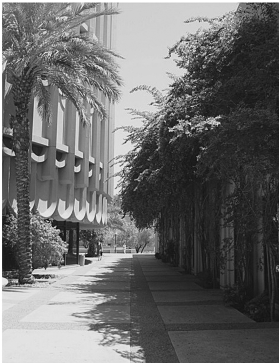
Music Building courtyard

Omnibus Courses. For an explanation of courses offered but not specifically listed in this catalog, see "Omnibus Courses," page 50.