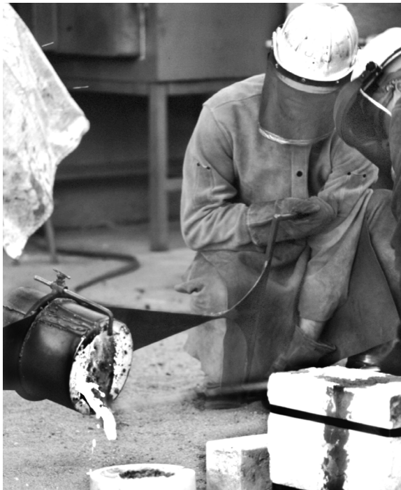
Metalworking is just one of the wide variety of course offerings within the M.F.A. degree program.

Omnibus Courses. For an explanation of courses offered but not specifically listed in this catalog, see "Omnibus Courses," page 50.