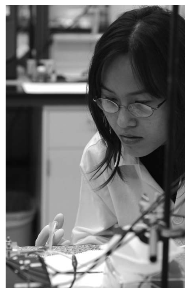
A Biodesign Institute researcher performs microchip analysis.

DMIT Instruction Support Lab. The Instruction Support (IS) Lab provides an environment in which faculty may seek and receive one-on-one, guided, or independent support for course development and delivery. Expert staff work closely with faculty to refine and develop their skills and confidence in the design and delivery of instruction through a variety of technology-supported means, both synchronous and asynchronous. Located in CPCOM 213, the IS Lab provides faculty, university professionals, and graduate students with a unique opportunity to integrate technology with instruction. The IS Lab sponsors workshops and demonstrations and serves as a dynamic clearinghouse of information and referrals for effective integration of technology with education. For more information about IS Lab resources, support, and workshops, access the Web site at dmit.asu.edu/islab.