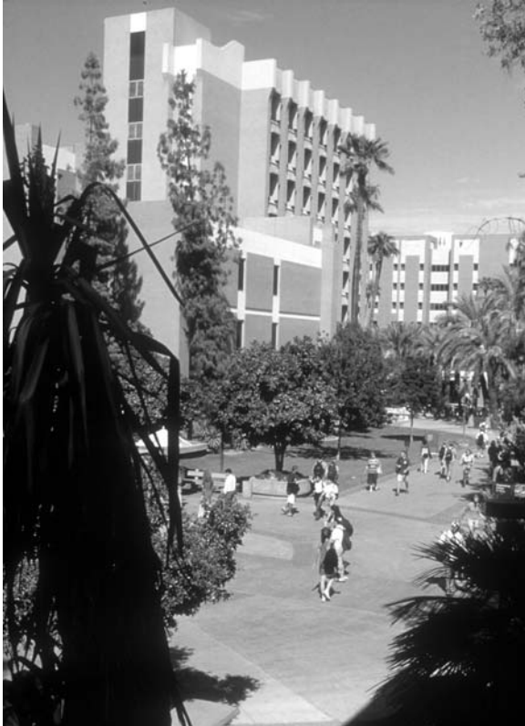
Looking east down Tyler Mall toward the Bateman Physical Sciences Center