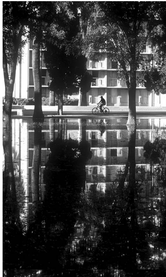
Tempe campus features more than 300 diverse species of trees and plants.