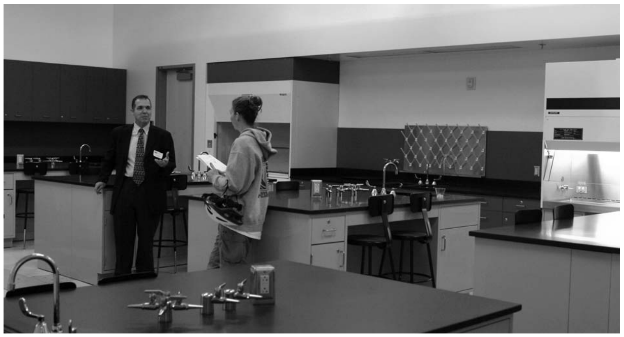
East campus students enjoy small class sizes and work in fully equipped laboratories.