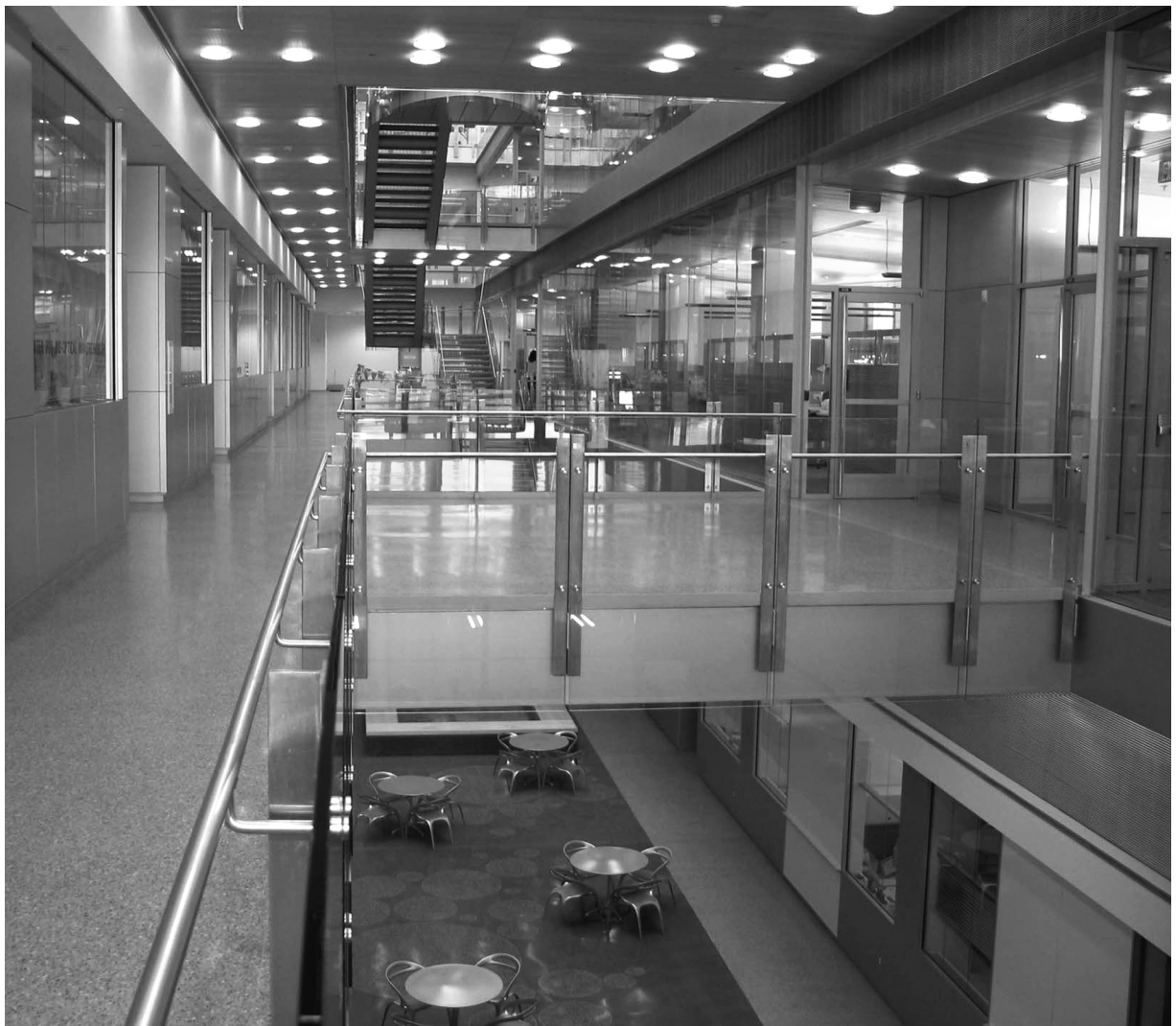
The atrium area in the new Biodesign Institute Building fosters the open exchange of ideas among researchers working on collaborative projects.

Joint Admission Continuous Enrollment. Courses with the JAC prefix are used to track students admitted to ASU who are concurrently or solely enrolled in courses offered by a community college.