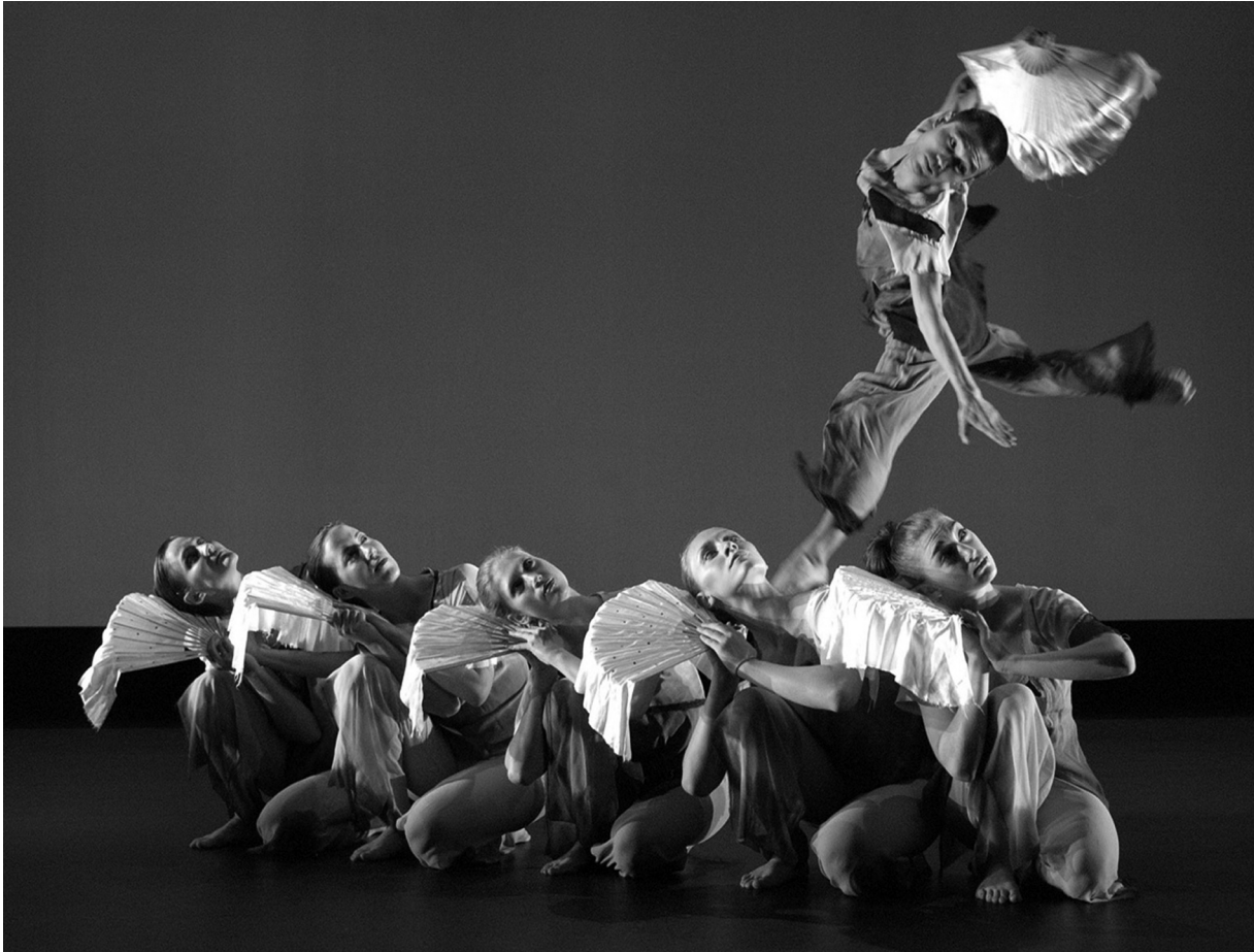
The Katherine K. Herberger College of Fine Arts Department of Dance is one of the nation's leading contemporary dance and dance education programs.