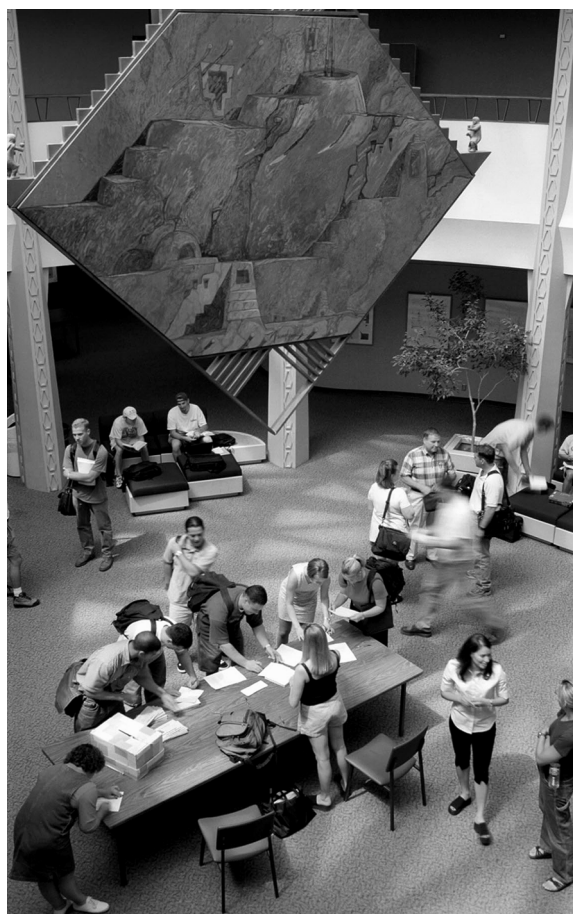
This Southwest-inspired hanging sculpture is prominently displayed in the College of Law's Armstrong Hall.

Preadmission information, advising, and continued support for the JD is provided by the College of Law Admissions Office, 480/965-1474.