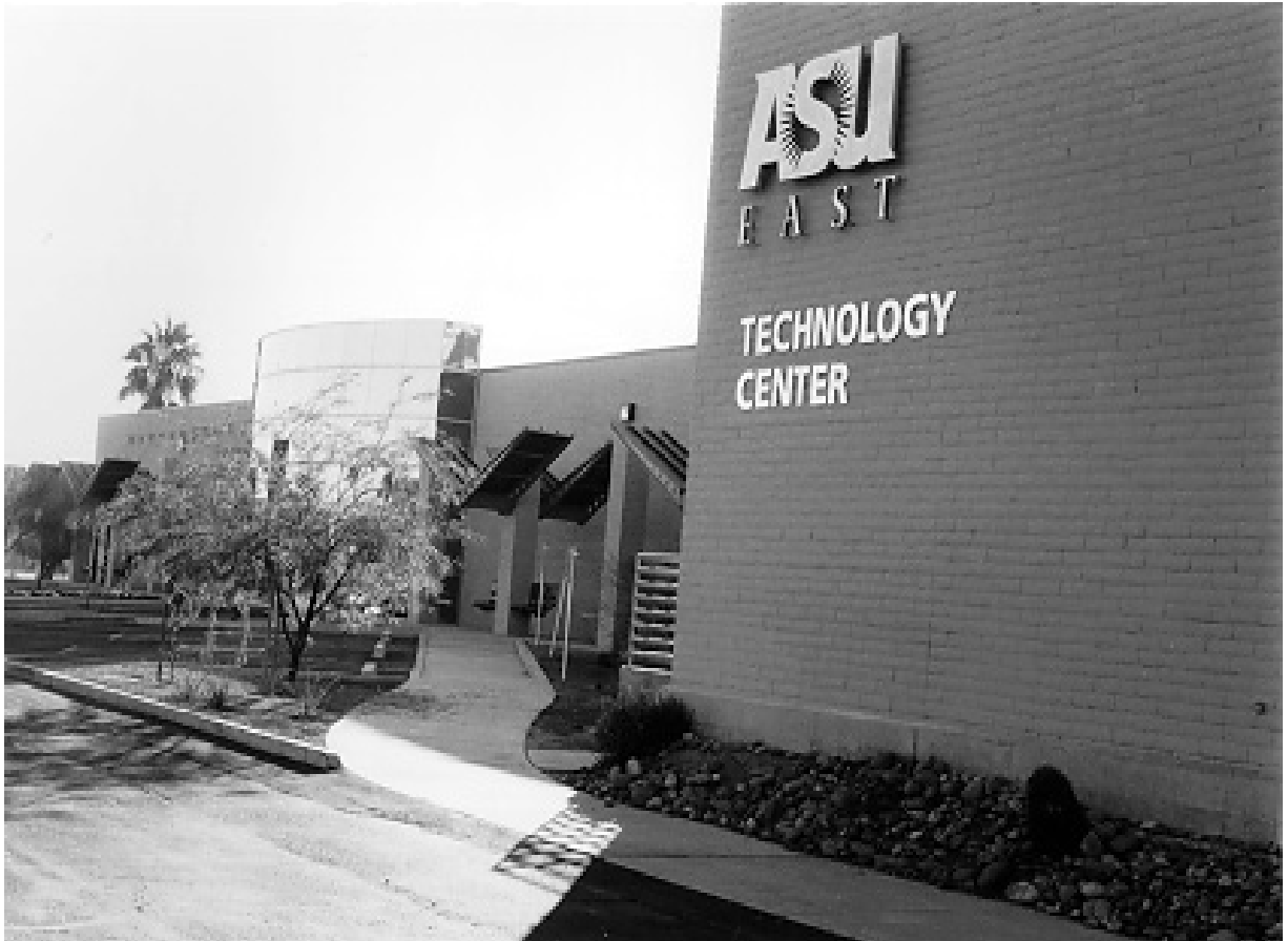
The ASU East Technology Center