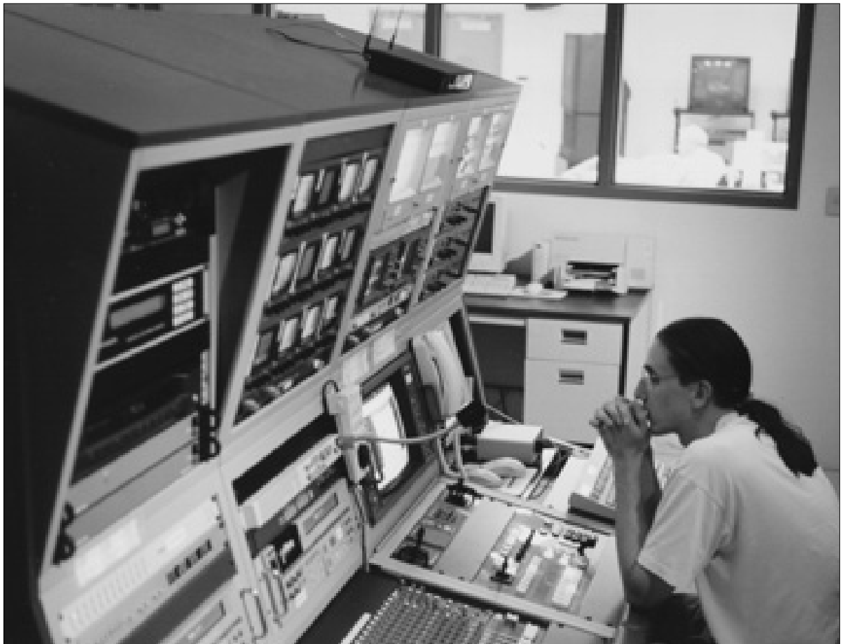
ASU East employee oversees the videotaping of an extended education class

Life cycle analysis, selection of environmentally compatible materials, design of waste minimization equipment and operation, economics of waste minimization and prevention. Prerequisite: ETC 340 or instructor approval.