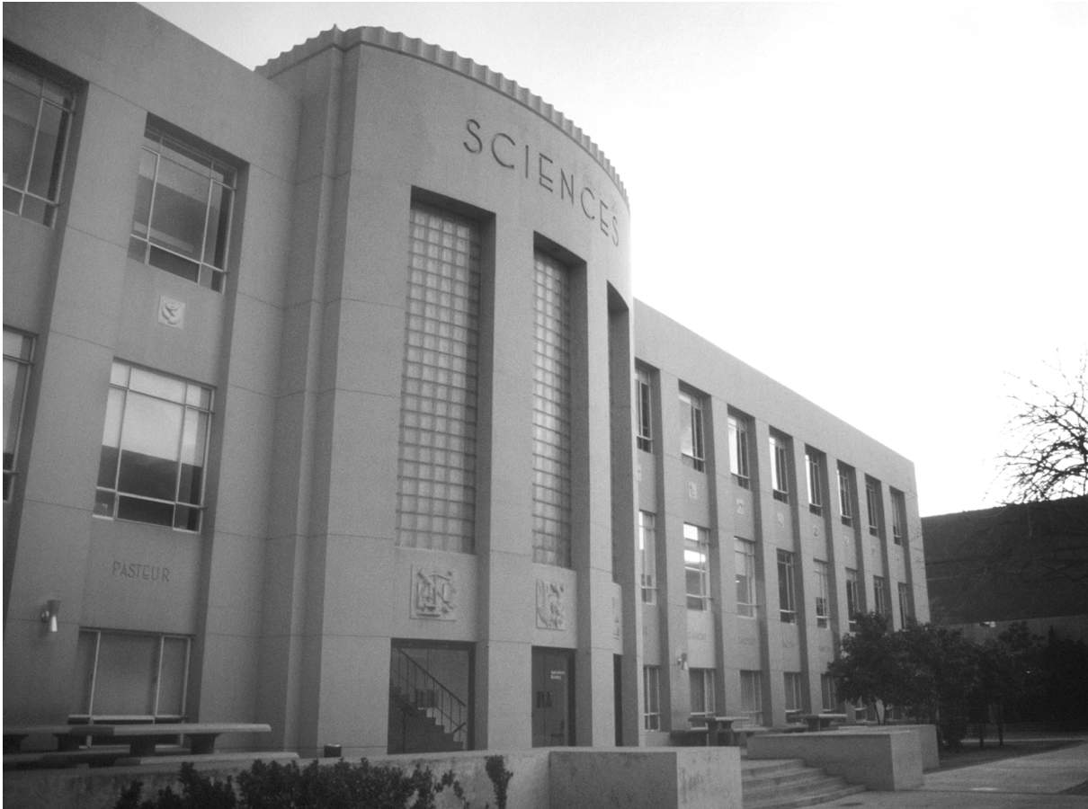
The Agriculture Building is located on ASU Main campus between the Memorial Union and the Student Services Building.