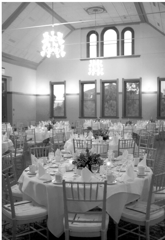
The ballroom in Old Main, after the restoration of 2001

Work taken during the summer sessions carries the same scholastic recognition as that taken during the regular semester. A complete schedule of offerings is available in the Summer Sessions Bulletin , which may be obtained from the Office of Summer Sessions.