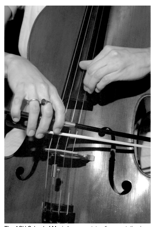
The ASU School of Music has an outstanding reputation in graduate programming.

Some changes in policies and procedures affect all students regardless of the catalog used by the student. These policies and procedures may appear in the catalog or in other university publications.