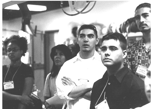
Students from all over the United States and Puerto Rico attending the 2002 Minority Graduate Education and Mountain States Alliance Graduate Fair and Student Research Conference took a tour of a laboratory in the Goldwater Center for Engineering Research at ASU.

See "Languages and Literatures," page 245.