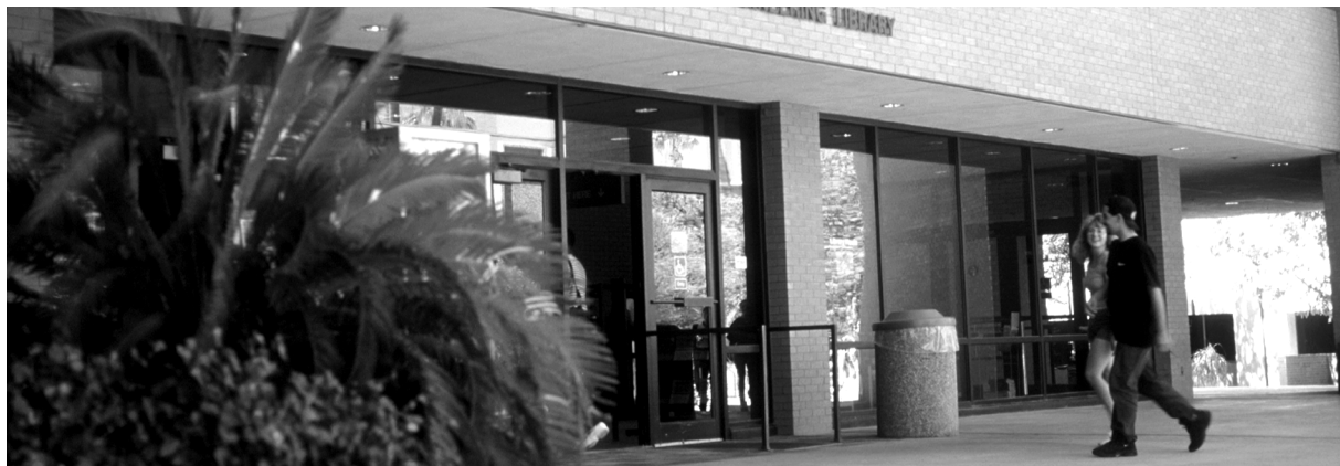
The Noble Science and Engineering Library

Omnibus Courses. For an explanation of courses offered but not specifically listed in this catalog, see "Omnibus Courses," page 48.