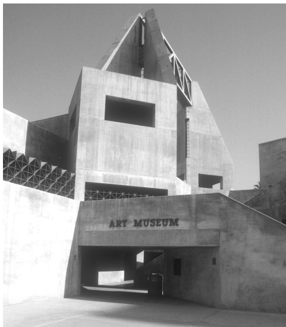
The ASU Art Museum in the Nelson Fine Arts Center

For courses, see “Linguistics (LIN),” page 202.