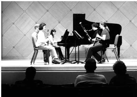
A graduate student quintet performs for community members at the School of Music.

See "Medieval and Renaissance Studies," page 268.