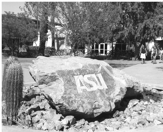
Palo Verde beach area between Palo Verde East and West Dorms

See "Doctor of Philosophy," page 96, for general requirements.