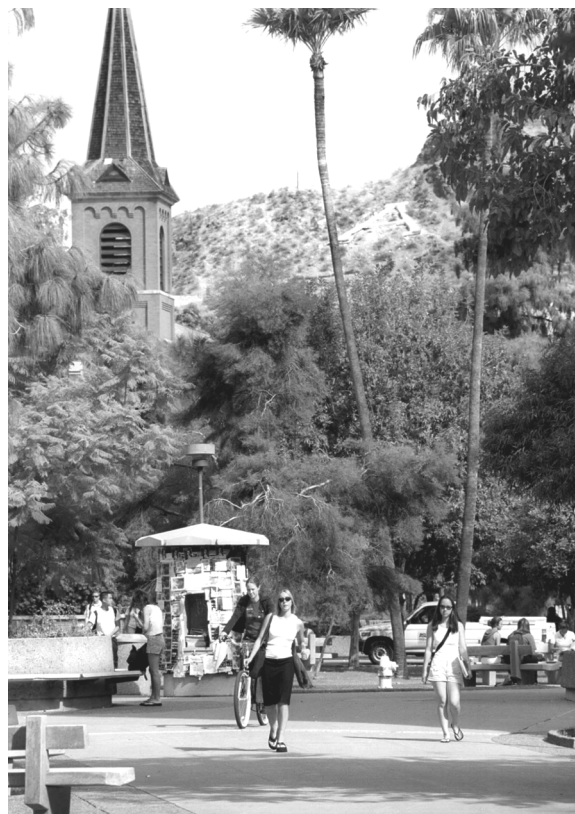
Cady Mall looking north toward "A" Mountain

Deficiencies. Deficiencies in undergraduate preparation (not to exceed 12 hours) may be removed while pursuing the M.A. degree; courses taken to remove deficiencies may not be counted toward the degree.