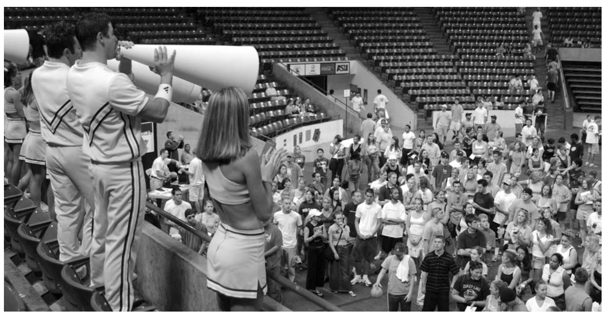
ASU Cheerleaders teach incoming freshmen "Onward to Victory," the ASU fight song, during Spirit Night in Wells Fargo Arena.