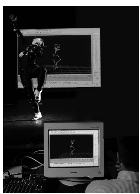
The Arts, Media, and Engineering program is offered collaboratively by the Katherine K. Herberger College of Fine Arts and the Ira A. Fulton School of Engineering.

Science Math Engineering Competition Awards (SMECA) Scholarships. The school has a limited number of scholarships available to students who competed during high school in regional or national science, mathematics or engineering competitions (e.g., National Science Fair, FIRST). The scholarship is renewable up to five years. Interested students should access the school's Web site at www.fulton.asu.edu/fulton/students/sas/scholarships.php for details.